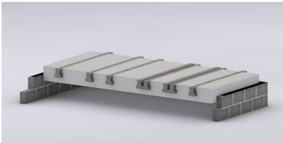
Thermal flooring systems help efficiency by increasing insulation and reducing u-values.

An additional benefit of this is the reduction of impact on the environment through transportation of EPS panels on road networks.