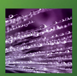
evoke fascia, soffit & coping