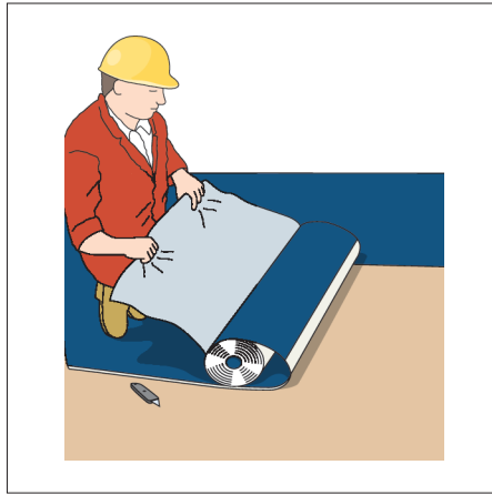
Figure 1 Membrane laying process

14.3 Overlaps for the underlay must be a minimum of 75 mm, both for side laps and end laps.